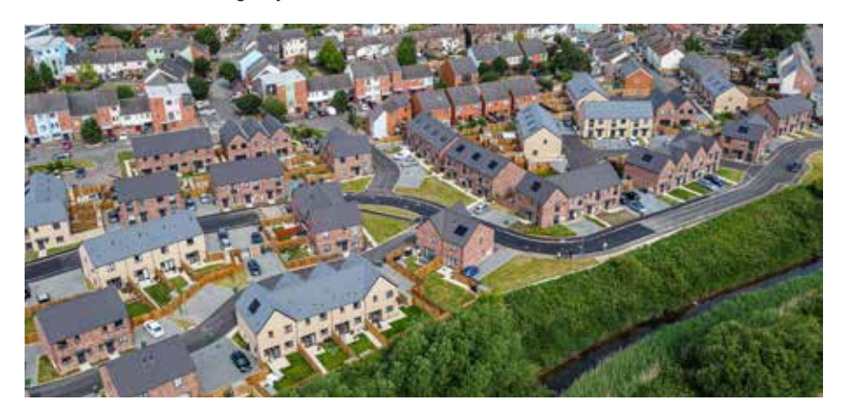
Nar Ouse Development, King's Lynn