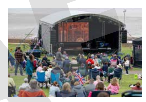
Community Event, Hunstanton