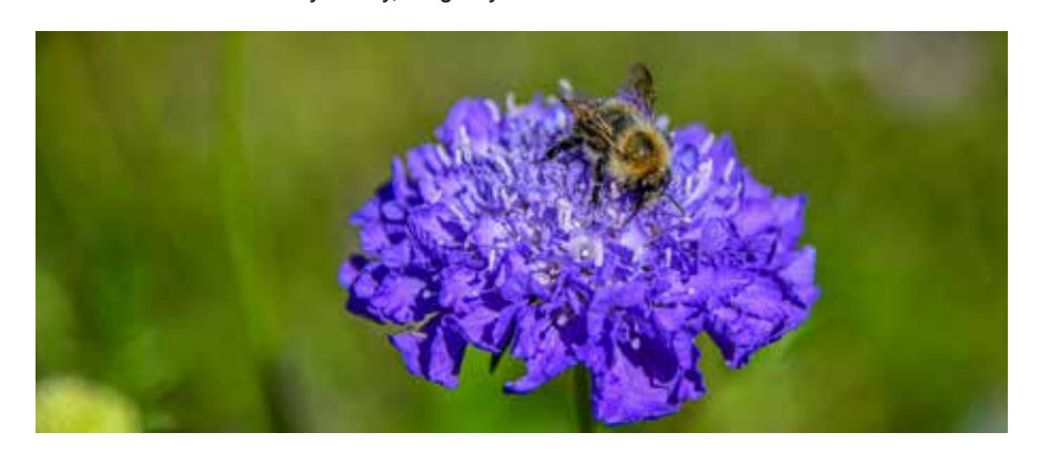
Wildflower and Pollinator Opportunities