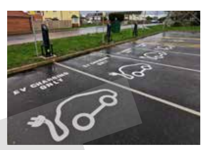
EV Chargers, Lynnsport